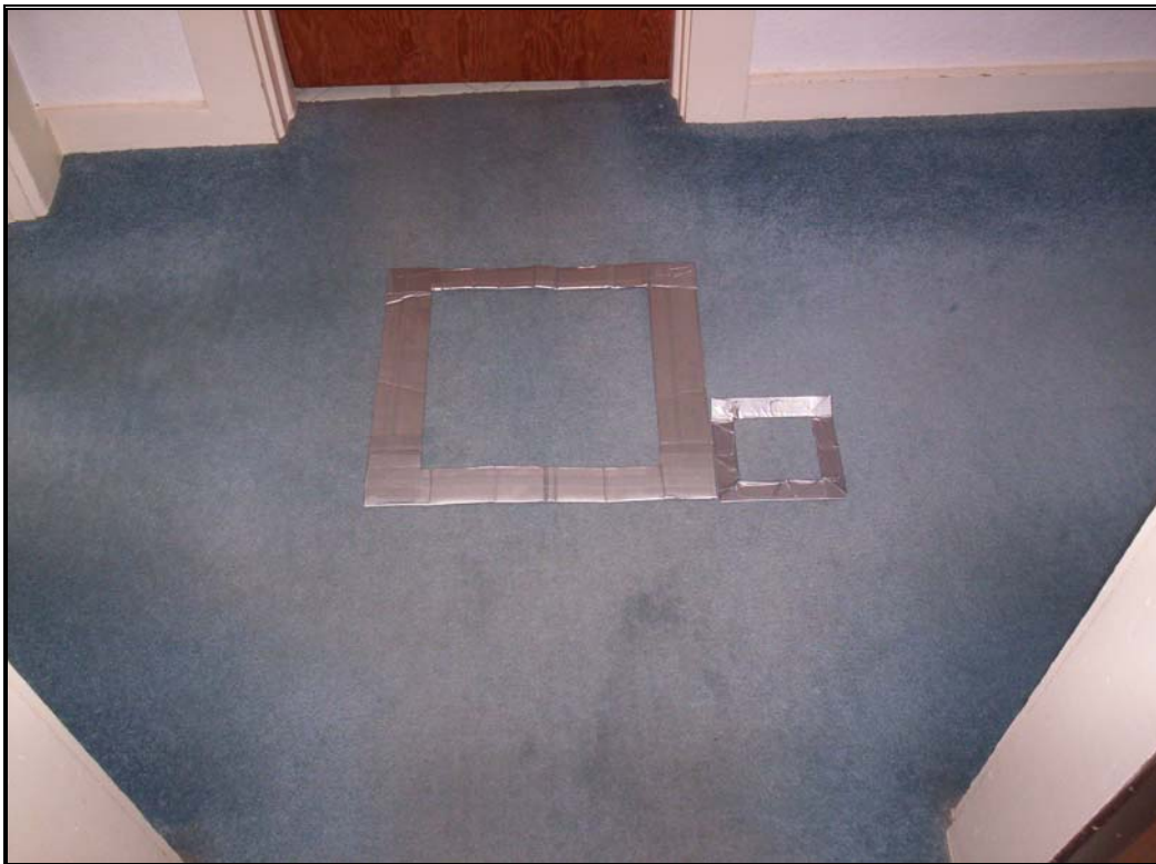
Fabric surface samples from carpet