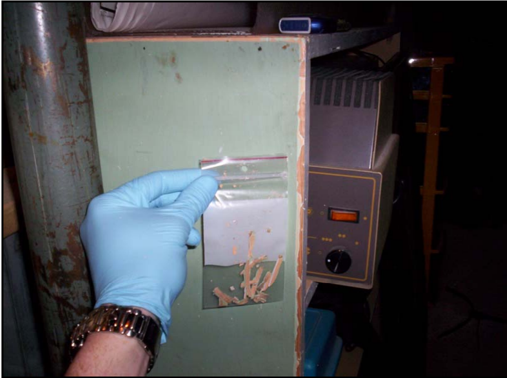
Lead in paint chip sample