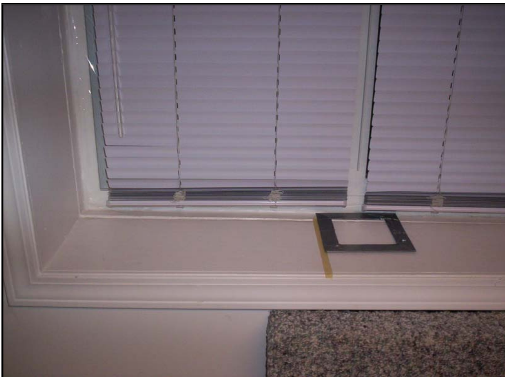
Hard surface samples from window sill