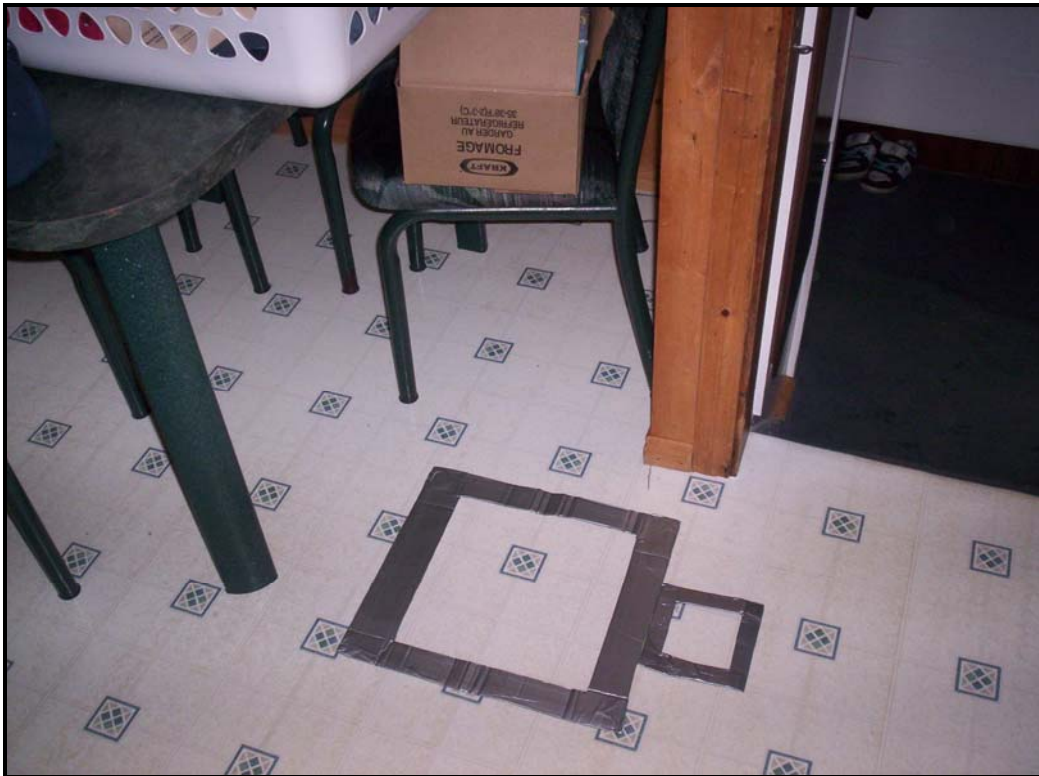
Hard surface samples from floor